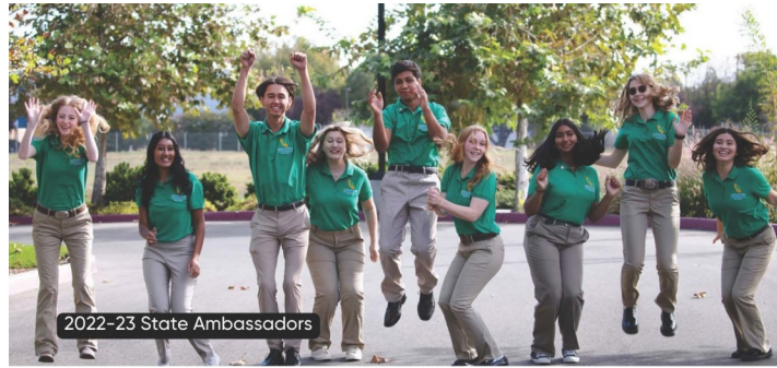
2022-23 State Ambassadors

Tag us in your posts so we can share your posts on the state sites