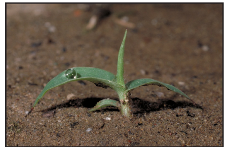
Figure 3. Smooth crabgrass seedling.

Seedling leaves are light green and hairy. True leaves are generally 3 inches long and hairy on the upper surface of the leaf and leaf sheath. The collar region and flower stalk are similar to that of smooth crabgrass, but the branches are longer—about 2 to 5 inches—at the end of the stalk. One source reports seed production from a single, large crabgrass plant can be as high as 150,000.