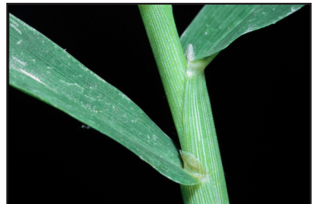
Figure 4. Smooth crabgrass collar region and sheath. The ligule at the base of the leaf blade is a short projection, and there are no auricles.