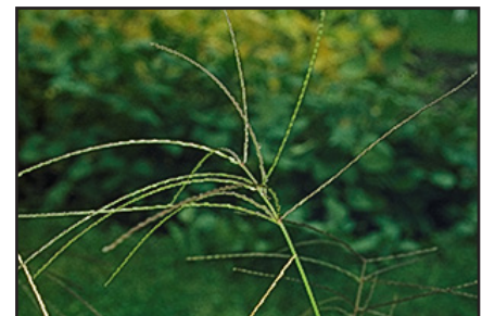
Figure 5. Flowering stem of smooth crabgrass.