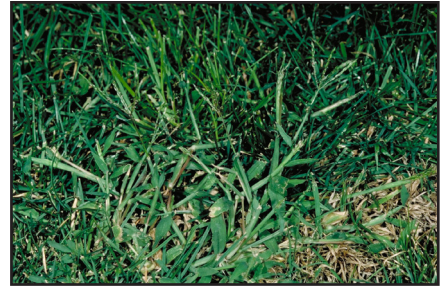
Figure 2. Large crabgrass in a lawn.

and inconspicuous, and the collar region lacks the clasping, prominent outgrowths or auricles present on some grasses. The leaf sheath and upper leaf surface are smooth, but a few hairs can be present on the lower leaf surface. Sometimes a reddish tint is visible at the base of the leaf.